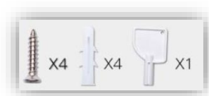
Mounting kits & key