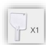
Mounting kits & key