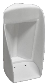
Elevator Corner Mount