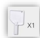
Mounting kits & key