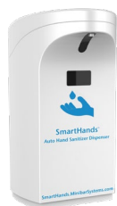
Hand sanitizer dispenser