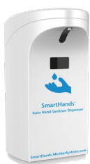
Hand sanitizer dispenser