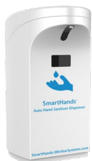
Hand sanitizer dispenser