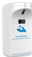
Hand sanitizer dispenser